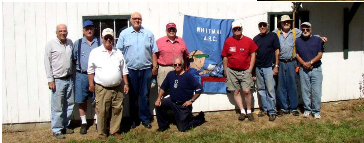
The Marshfield Fair Antenna Crew