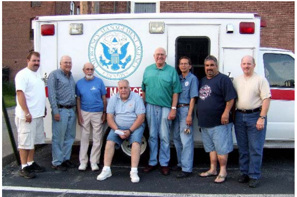
Taunton RACES volunteers