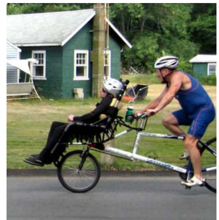
Team Hoyt - Biking

We had no problem communicating with Carl Aveni N1FY who was Net Control and operating on 146.565 MHz simplex. Many participants thanked the volunteers and YMCA staff for being out there.