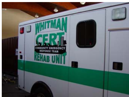
WHITMAN CERT REHAB UNIT