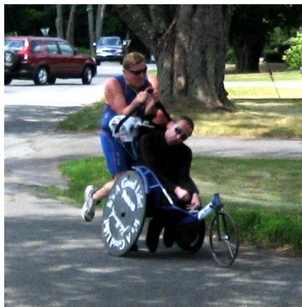
Team Hoyt - Running

Some drivers were being cautious and driving slow and some of the highly competitive speedy bike racers could be heard shouting at them to speed up. The last place participant was over 70 years old and we kept an eye on him.