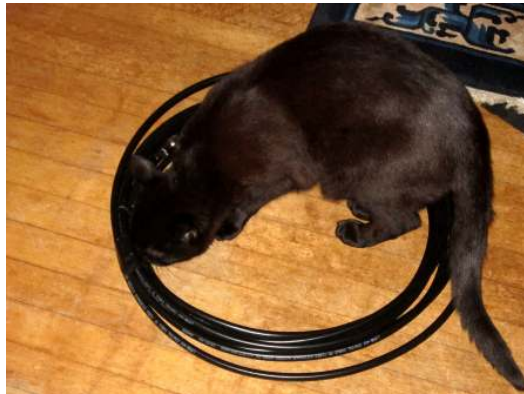
Tuxedo the Inspector