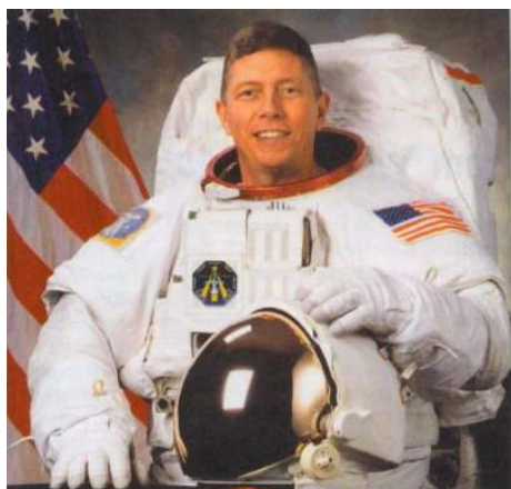
Mike Fossum, KF5AQG