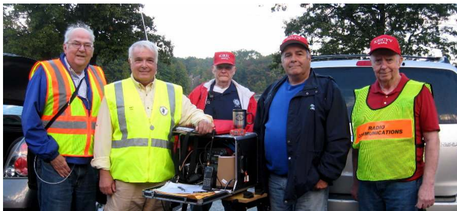
Public Service Radio Team volunteers