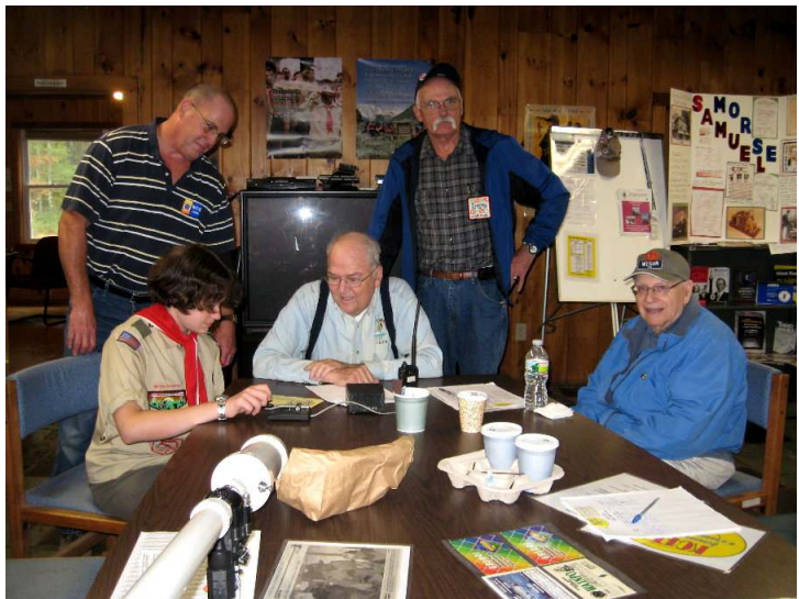
Sending Morse code