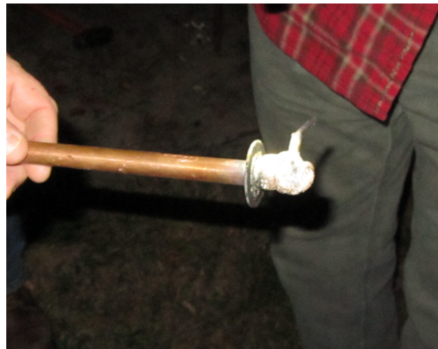
The weld is complete!