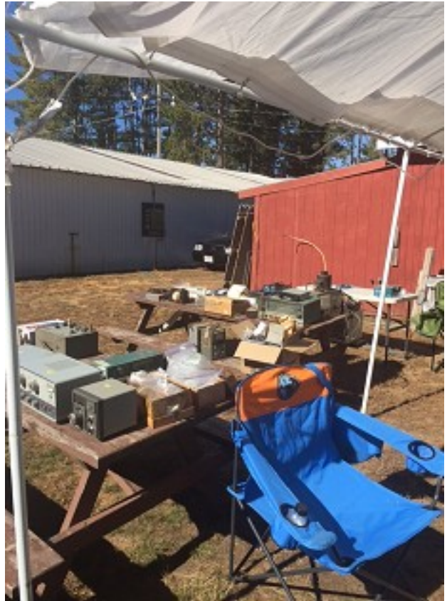
The Whitman club equipment out for buyers to check out