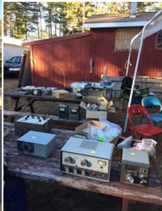
and the equipment for sale