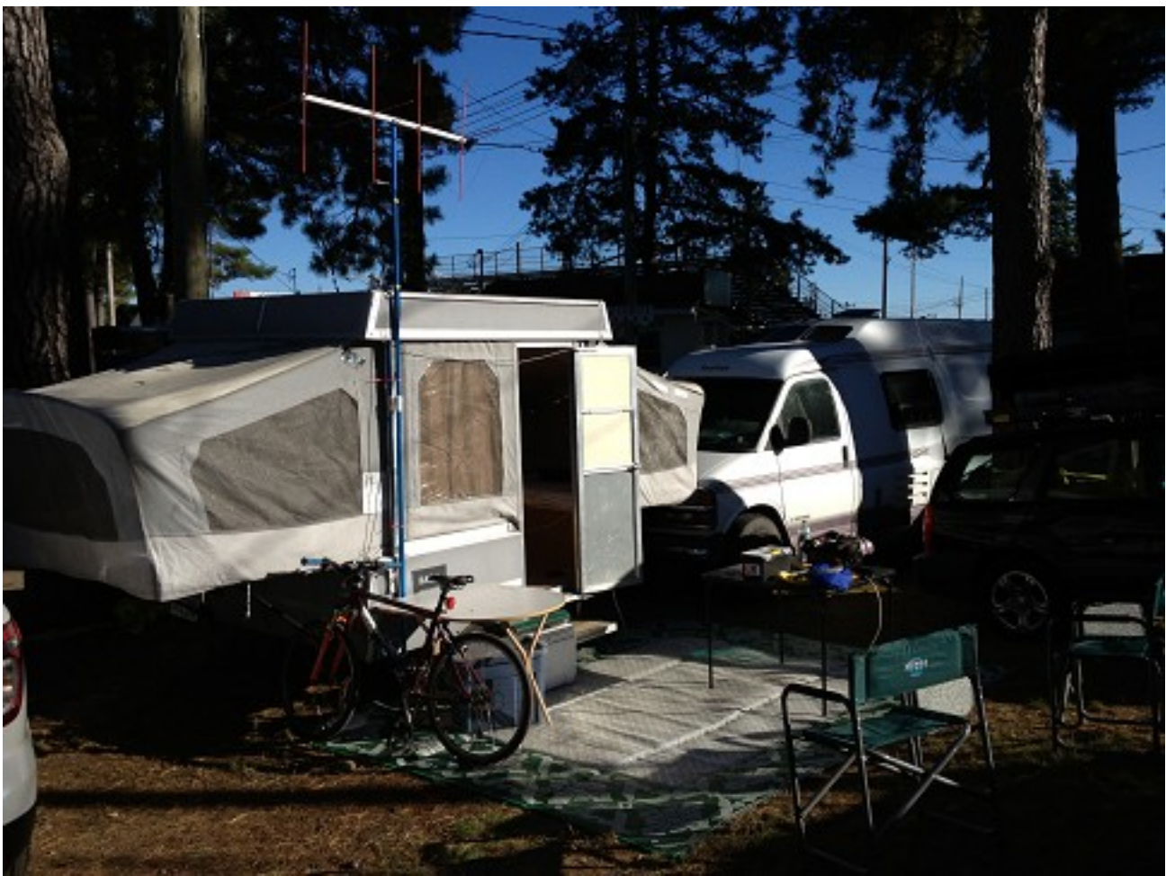
The beautiful BABB COMM ONE camp site. This year Chris added a homemade 2meter, 4 element beam (below)