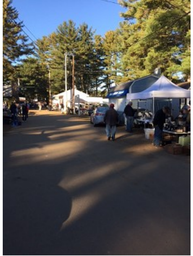
2 beautiful days but a cold Friday night at NEAR-Fest this fall.