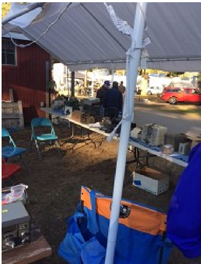
more equipment for sale