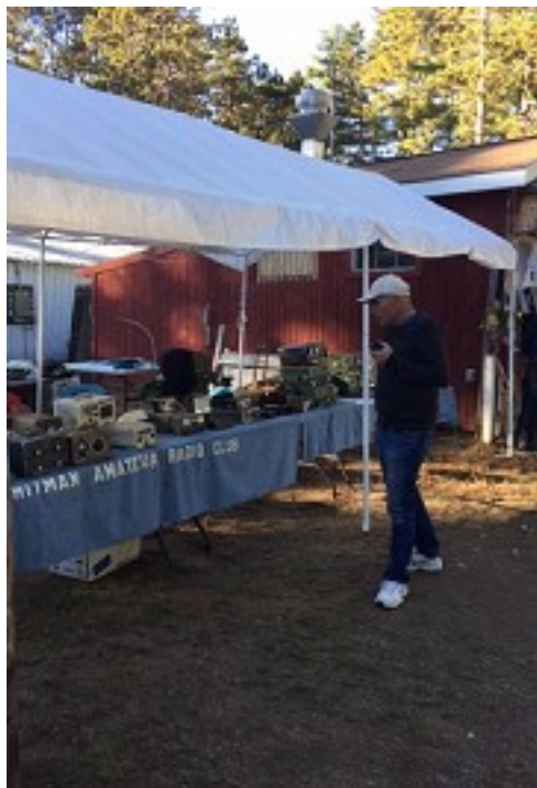
The Whitman club booth