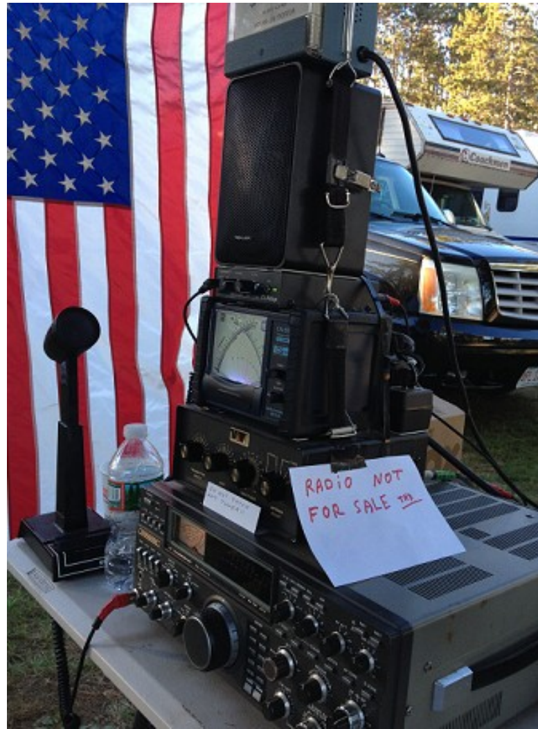
Marks HF Field Kit - definitely not for sale!