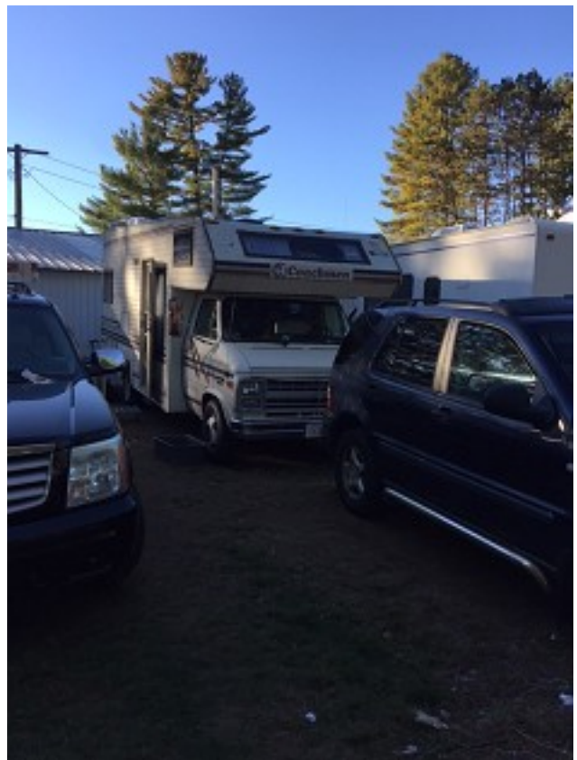
Jeff N1SOM's camper in place for the night